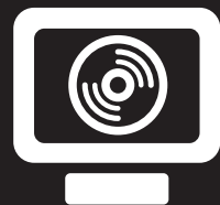
Software & Technology