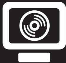
Software & Technology