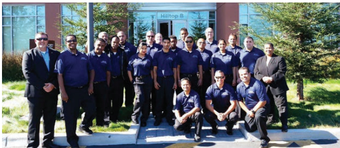
G4S Secure Solutions Team

San Jose, CA: G4S was happy to be of service to our international software company customer at their annual Halloween concert. Each year, the company hosts a Halloween concert event for all staff, family and friends. This is the second year G4S has been invited to provide security for their big event. Last year's event featured Ariana Grande and this year the headliner was Billboard star Nick Jonas. With 10,000 guests in attendance, G4S staff provided security at the entry gates, assisted with customer service and ensured a safe and secure environment for concert goers.